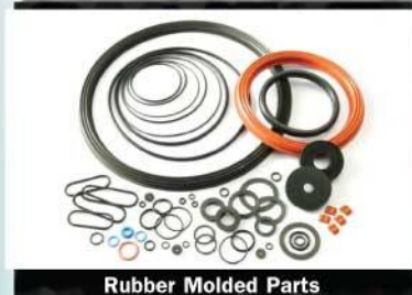
Rubber Molded Parts