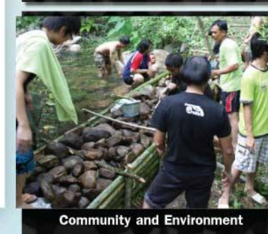
Community and Environment