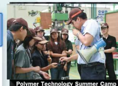
Polymer Technology Summer Camp

Innovation Group will continue to contribute to society by providing knowledge and technology to universities and industries.