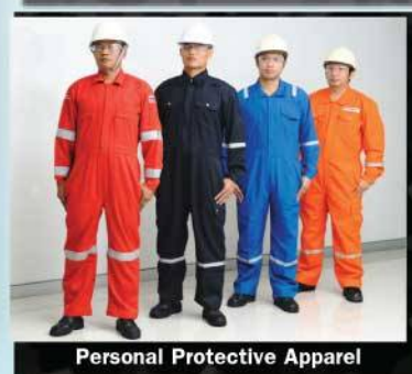
Personal Protective Apparel